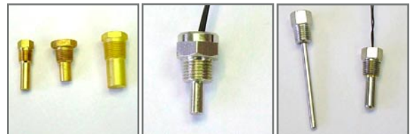
BPT 3 Housings