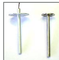
FAL / FSS