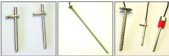
TSS50-3.8 / TSS50-3.2